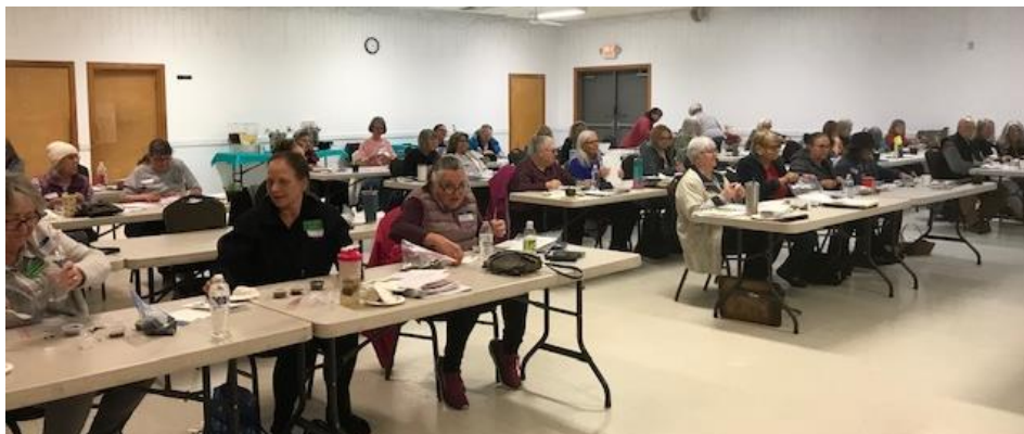
Classroom set up

Course #1 had 47 people attending and course #2 had 45 people in attendance.